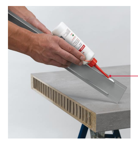
Apply the adhesive in the ridge area of the decor profile