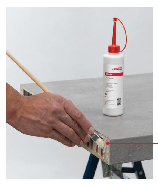
Distribute the adhesive evenly with the use of a brush