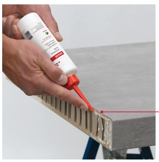
- Apply the adhesive to the worktop edges